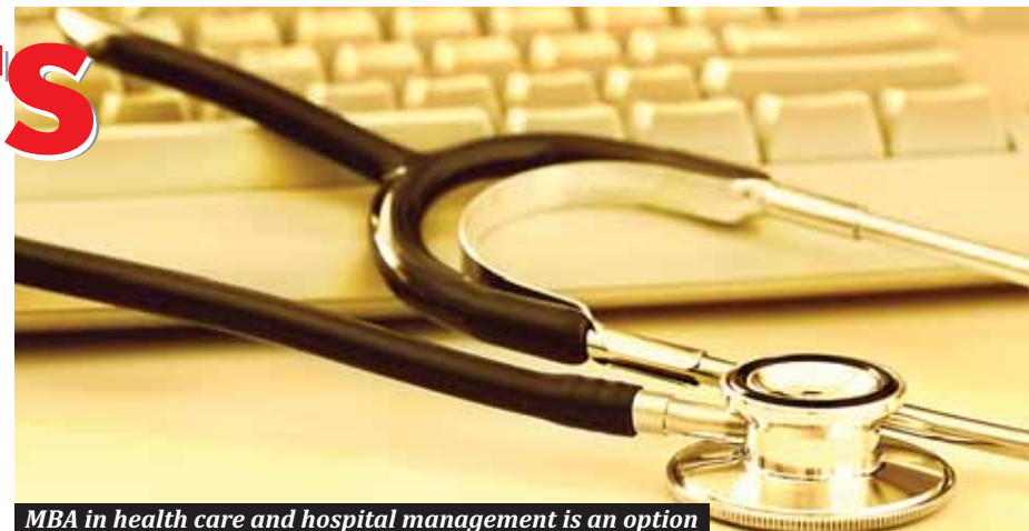
MBA in health care and hospital management is an option