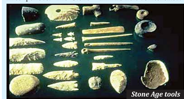
Stone Age tools

Stone tools were made from a variety of stone. For example, flint and chert were shaped (or chipped) for use as cutting tools and weapons, while basalt and sandstone were used for ground stone tools, such as quern-stones. During the most recent part of the period, sediments (such as clay) were used to make pottery. Agriculture was developed and certain animals were domesticated.