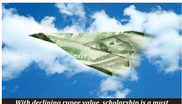
With declining rupee value, scholarship is a must

Cardiff University Scholarships for International Students (UK). There is a wide range of distinct scholarships available annually, at all academic levels: Undergraduate (3 scholarships), Postgraduate Taught - Masters (6 scholarships), and Postgraduate Re-