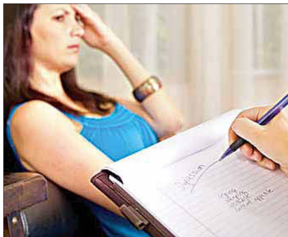
Studying Phd/Mphil in Psychology helps in the career

"I think, therefore I exist", so said a famous philosopher. Nothing could illustrate better that the mind (psyche) is indeed the central point of human existence. Not surprisingly, nothing can be more interesting and enthralling than psychology, which involves the study of the human mind/psyche. This field is gaining immense importance with the rise in mental and emotional stress levels in individuals, whether it is business executives, performers or athletes, psychologists are needed everywhere to combat stress levels and improve performance. But, a BA degree is normally not enough in this upcoming field, you need to do at least a major's in this subject and gain an in-depth knowledge base in a specified area. If you can do a Phd/Mphil, then nothing