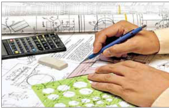
Engineering requires creativity to innovate and design products

It has been noted that creative people always have an inner need to enunciate their creativity, because creative energy can never be locked and has to be channelised and the idea in the head has to be born. They express themselves through creative projects, and engineering is one such creative field. The common elements of creativity are originality and imagination and this is what is basically utilised by engineers to invent, design, and build things that matter. An engineer, by dreaming up creative and practical solutions has made possible new